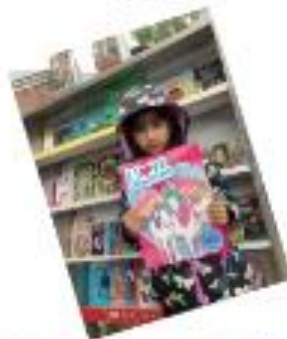
Choosing our own books from the book fair