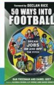
The Reader Teacher Non-fiction Book of the Month