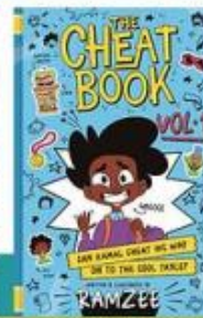
The Cheat Book by RAMZEE