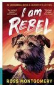
The Reader Teacher Fiction Book of the Month